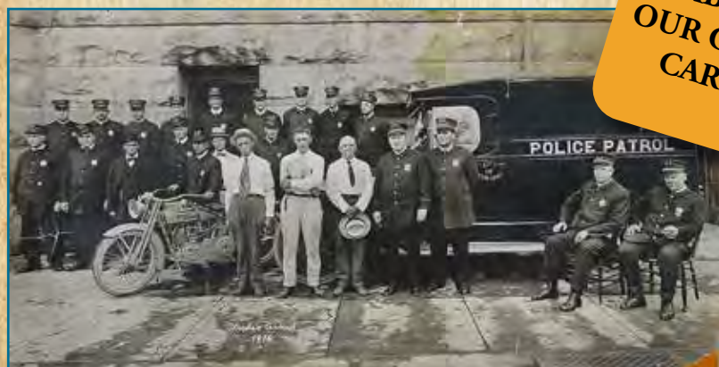
Kokomo Police Department, early 1900's.

Our own apple hickory, slow smoked pulled pork, cole slaw & American cheese sandwiched between grilled marbled rye bread - 12.99