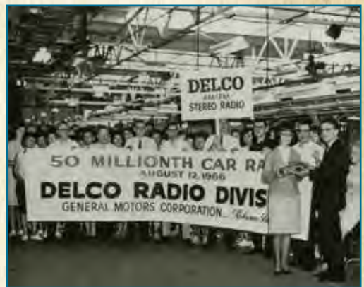
Group of Delco Radio employees celebrating production of the 50 millionth car radio. 1966

Kokomo is not a town of the past. It is alive and growing with commerce, industry and people. All the staff at the Half Moon Restaurant and Brewery welcome you to Kokomo and hope you enjoy your stay with us.