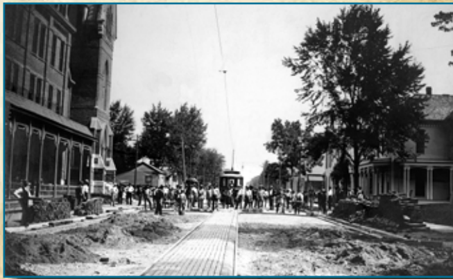
Paving North Main Street • Kokomo, 1899

Fiesta Burger* - A chargrilled steakburger cooked to order and topped with pepper jack cheese, fried jalapeno bottle caps, and served with house made salsa on the side. - 15.99