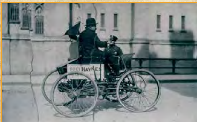
Elwood Haynes in his first car, talking to a policeman.