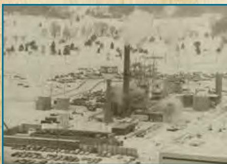
Aerial view of the Chrysler Plant, looking to the southwest. 1985

The gas boom had gone dry for most of Indiana by 1900. Fortunately for Kokomo, many of its industries chose to convert their factories to coal or another energy source rather than relocate. The elegant Victorian homes still standing in Kokomo give the town a beautiful reminder of its glorious past. Several downtown buildings, such as the City building, are also prime examples of the gas boom's effect on Howard County architecture.