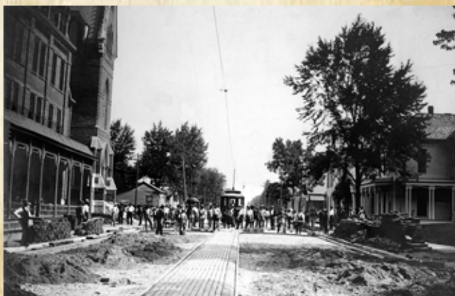
Paving North Main Street • Kokomo, 1899

Fiesta Burger* - A chargrilled steakburger cooked to order and topped with pepper jack cheese, fried jalapeno bottle caps, and served with house made salsa on the side. - 14.49