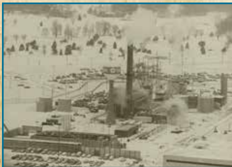
Aerial view of the Chrysler Plant, looking to the southwest. 1985

Kokomo still remains an industrial center for the automotive and steel industries. Chrysler Corporation and General Motors have replaced the Haynes name, and the Cabot Corporation now is located at the former site of Monroe Seiberling's Kokomo Strawboard Works. Once more, Kokomo is going through the change of times as it changes from its industrial labor-intensive base to a high technology electronics center for the world.