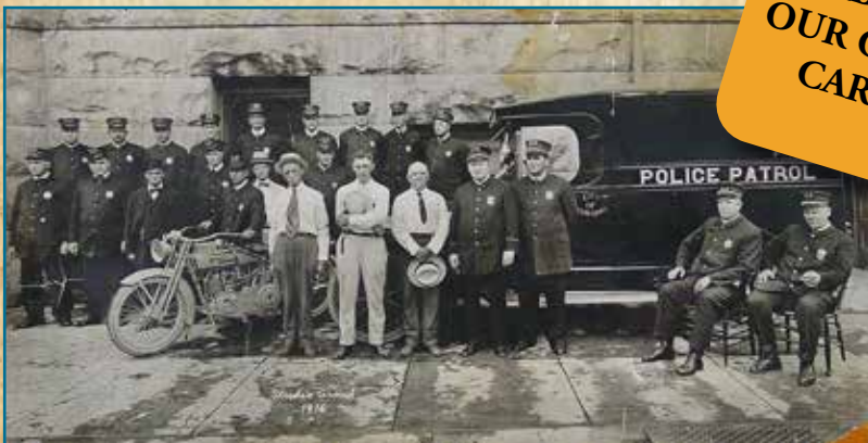
Kokomo Police Department, early 1900's.

Our own apple hickory, slow smoked pulled pork, cole slaw & American cheese sandwiched between grilled marbled rye bread - 12.49