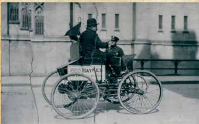
Elwood Haynes in his first car, talking to a policeman.