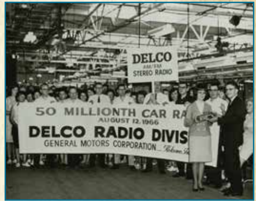
Group of Delco Radio employees celebrating production of the 50 millionth car radio. 1966

The gas boom had gone dry for most of Indiana by 1900. Fortunately for Kokomo, many of its industries chose to convert their factories to coal or another energy source rather than relocate. The elegant Victorian homes still standing in Kokomo give the town a beautiful reminder of its glorious past. Several downtown buildings, such as the City building, are also prime examples of the gas boom's effect on Howard County architecture.